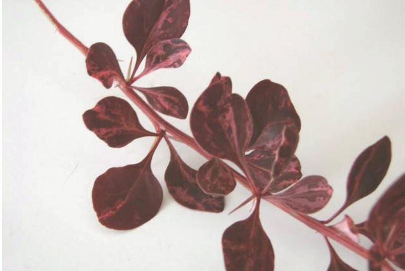
Figure 1. Systemic mosaic symptom on Berberis thunbergii atropurpureum plant.

[16] Petrzik, K., 2005. Capsid protein sequence gene analysis of apple mosaic virus infecting pears. Eur J Plant Pathol 355-360.